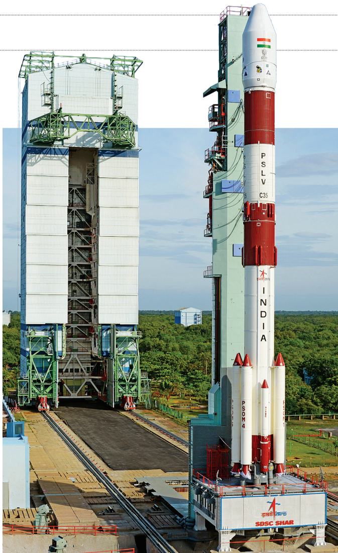
Fully integrated PSLV-C35 with Mobile Service Tower withdrawn to parking end

reduce communication errors, and improve the accuracy of the Indian alternative to the GPS system.